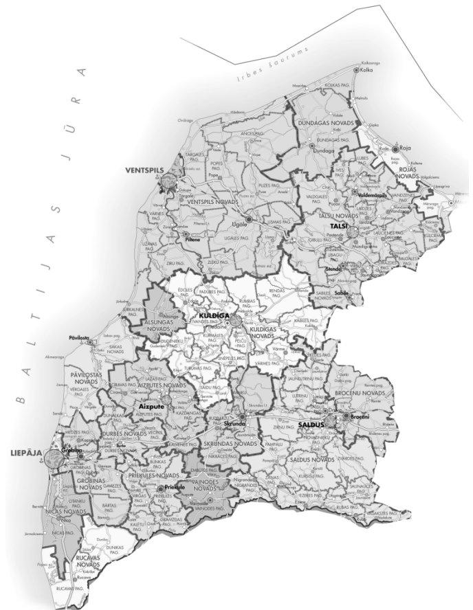
Fig. 2. Plan of Kurzeme region [14].

of all farms together constitutes 43% of the region's arable land. 135 thousand inhabitants live in Kurzeme region, which is 13% of total population. Most people in the region are located in two major cities - in Liepāja and Ventspils. The resources necessary for the development of economy are mainly concentrated in two major cities. Other parts of the region are developing quite unevenly, in many parishes GDP per capita is low and the population drain is a pressing concern. The region, as other regions in the country, is now generally suffering from the drain of skilled labour.