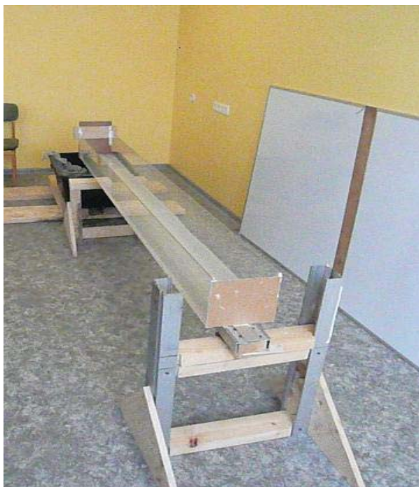
Fig. 1. Large container experimental equipment for fibers flow mechanics investigation.

Short fibers as reinforcement are used in many structural applications in aerospace, automotive, machine building and civil engineering industries. Important part of fabrication technologies for such materials is based on structural element mould filling by liquid matrix with short fibers. Traditionally the matrix is viscous (polymers, fresh concrete). After maturing and demolding structural element mechanical properties are highly dependent on fiber distribution and orientation in the element body. For example, polymer matrix composite with short glass fibers or steel fiber reinforced concrete post cracking behavior and load-bearing capacity are dependent on the number of fibers crossing the weakest crack (bridged the crack) and their orientation to the crack surface [1-3]. This is why it is important to investigate this process.