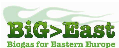
Figure 1: BiG>East logo

Further information about the BiG>East Project is available on the project website: www.big-east.eu .