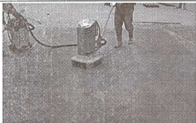
Fig. 3. Floor polishing and grinding