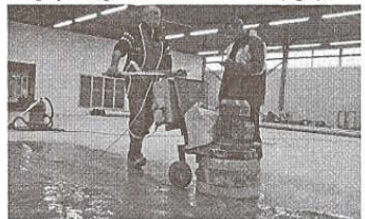
Fig. 2. Rigid polishing of concrete floor surface

Rigid polishing of the concrete floor surface (Fig. 2);