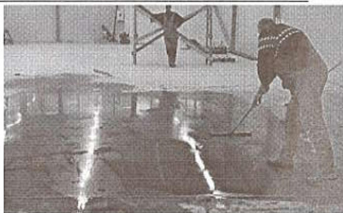
Fig. 4. Flooring by special maintenance means

Flooring by special maintenance means (Fig. 4) is performed with account of the maintenance conditions.