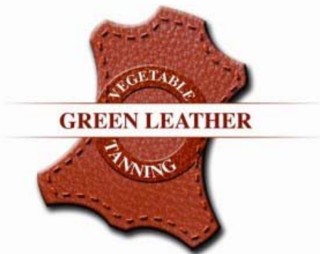
Fig.2. Leather icon [8]

Leather is a natural fabric (Fig. 2). It has high tensile strength and is exceptionally tough and resilient, yet it is flexible and – as suede – is soft to touch. It is prepared by tanning of animal hide. Tanning is a smelly process, where a hide is soaked in solutions of tannins for weeks or months, making it pliable and resistant to decay. Leather is used for belts, gaskets, shoes, jackets, handbags, linings and coverings.